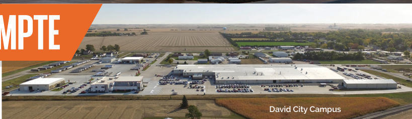
David City Campus

Timpte has been serving the transportation industry since 1884; longer than any other trailer manufacturer. Headquartered in David City, NE since 1980, our 60-acre campus includes our Corporate Headquarters, Product Showroom, Manufacturing Center, Research & Development Center and Customer Support Center. Timpte is well known for our Super Hopper and Roughneck line of aluminum dry bulk commodity trailers and we're proud to be the #1 selling dry bulk commodity trailer in North America.