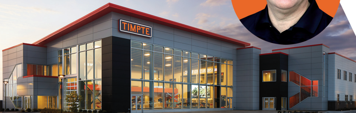
Corporate Headquarters & Product Showroom